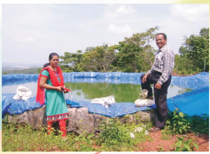
Jalakund technique assisted by the directorate.