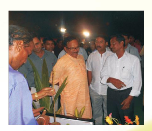
Hon. Chief Minister Shri. Laxmikant Parsekar watching the grafting technique during coconut and cashew show at Campal Panaji.