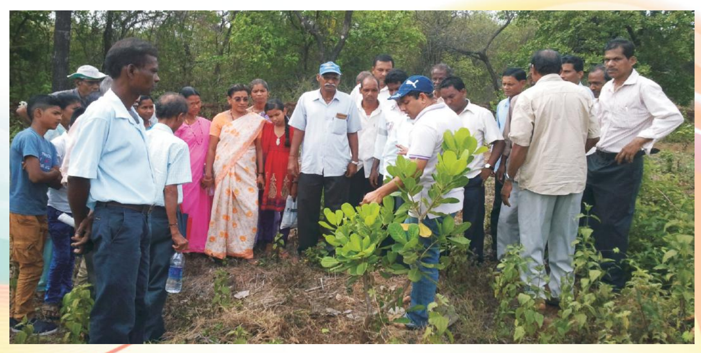
Visit of farmers to newly planted cashew plot.

Zonal agriculture office, Dharbandora took extensive drive in motivating farmer to take up systematic cashew plantation. Farmers planted/ replaced the old cashew plantation with new hybrid cashew grafts. More than 60 Ha area is been brought under systematic cashew plantation with next year target of more 50-60 Ha area and in next 4 years most of the area will be brought under cashew cultivation. The main focus in this village would be to increase area under systematic & profitable cashew plantation.