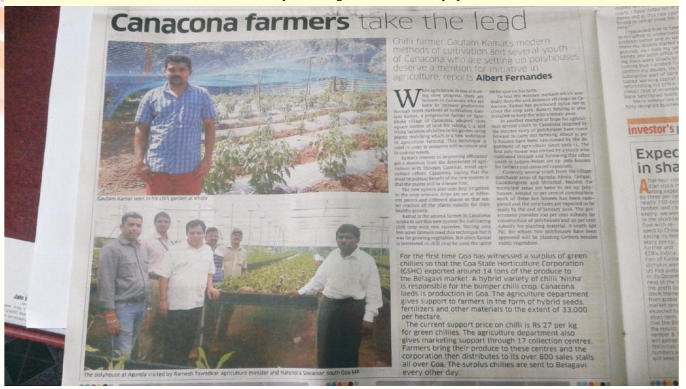
Hon Minister for Agriculture Shri. Ramesh Tawadkar sowing the seeds of sucess