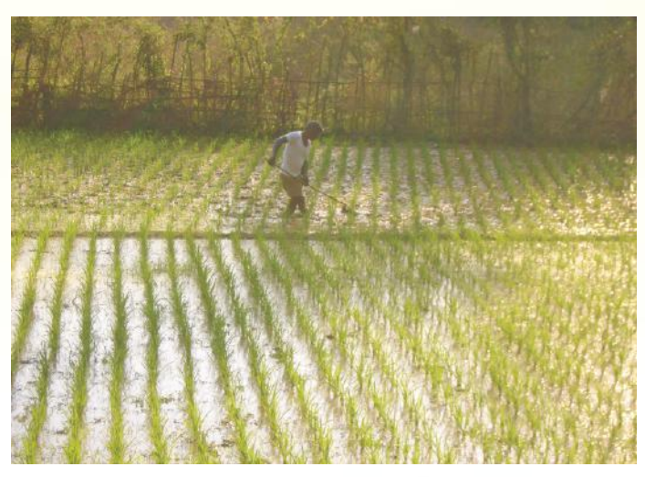
SRI Paddy cultivation using mechanical hoe technique assisted by the directorate.