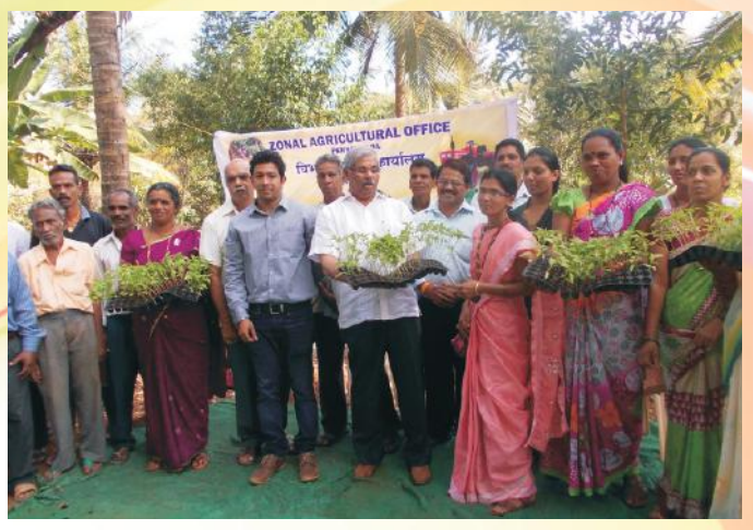
Honble Minister for Panchayat and Forest Shri.Rajendra Arlekar launching cultivation of Hybrid Chilli programme by distribution of Hybrid Chilli seedlings to farmers at Pedne