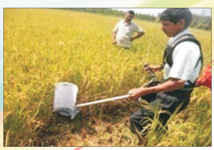
Paddy reaper Demonstration