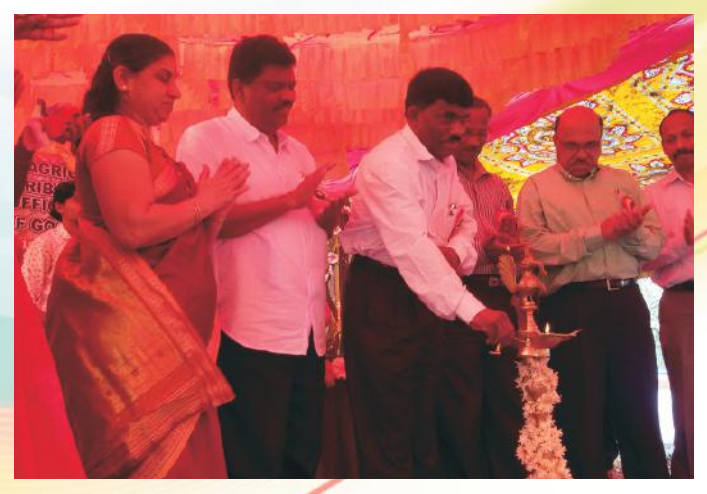
Honble Minister of Agriculture Shri Ramesh Tawadkar Inaugurating Krishi Mela.