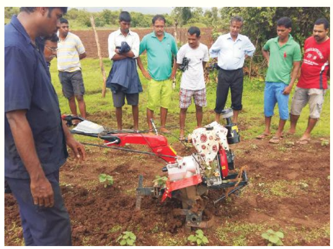
Demonstration of Mini Tiller For Intercultivation in Bhendi