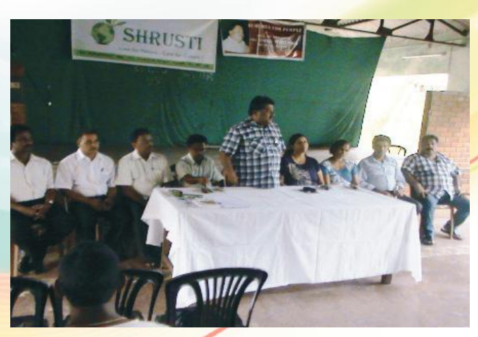
Shrusti program conducted at Agassaim along with MLA Vishnu Wagh.