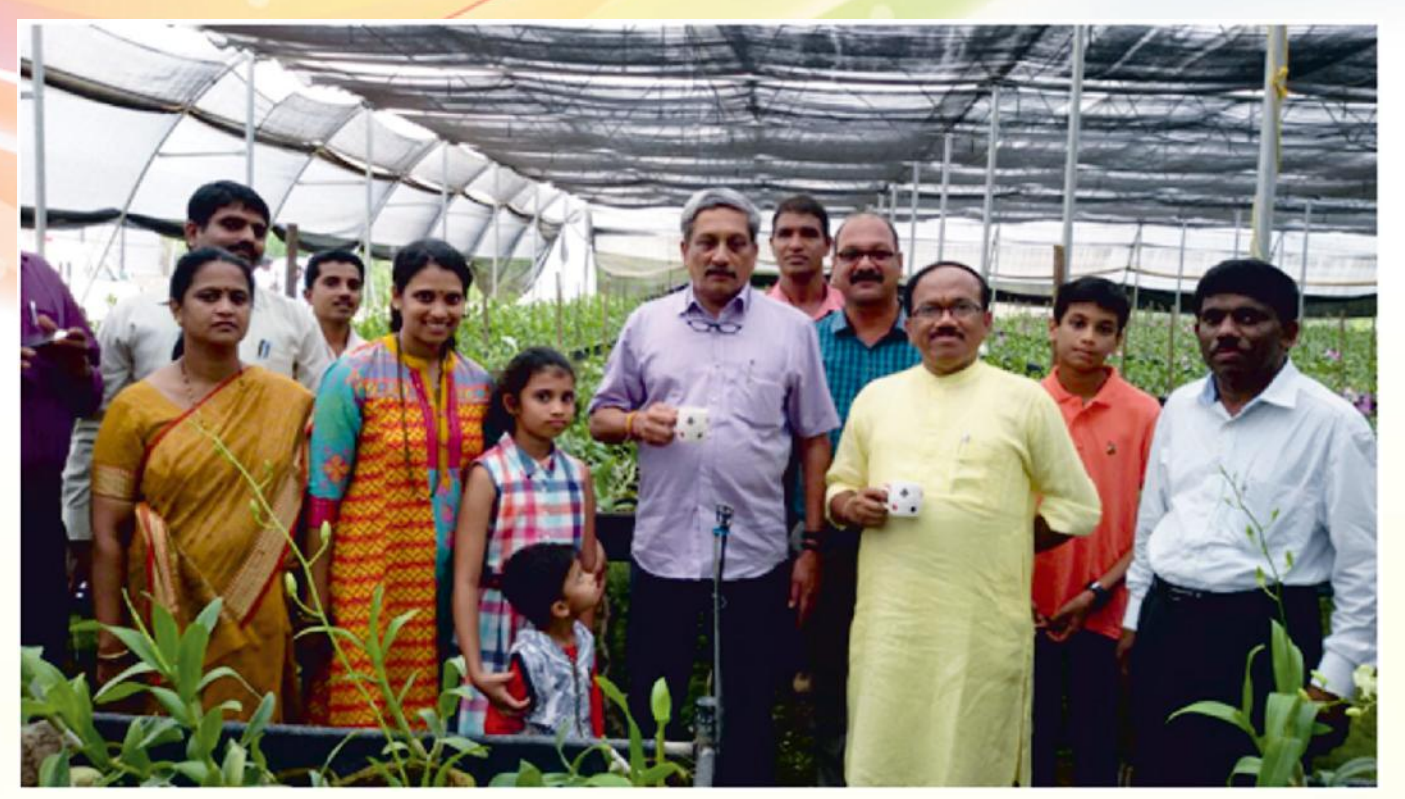
Visit of Defence Minister Shri. Manohar Parrikar, Chief Minister Shri. Laxmikant Parsekar and Agriculture Minister Shri. Ramesh tawadkar to Polyhouses in Canacona