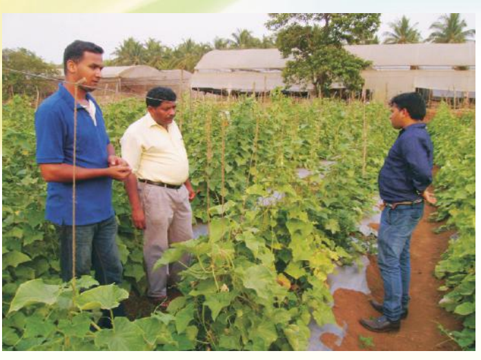
Cucumber cultivation with Drip and poly mulch technique assisted by the directorate