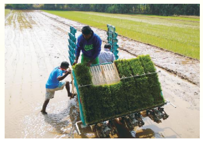
A view of Paddy transplanting with Paddy transplanter at Mandre.