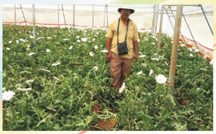
Gerbera Cultivation under poly house in Rivona Sanguem