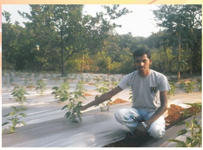
Hybrid Chilly cultivation with Drip and poly mulch technique assisted by the directorate.