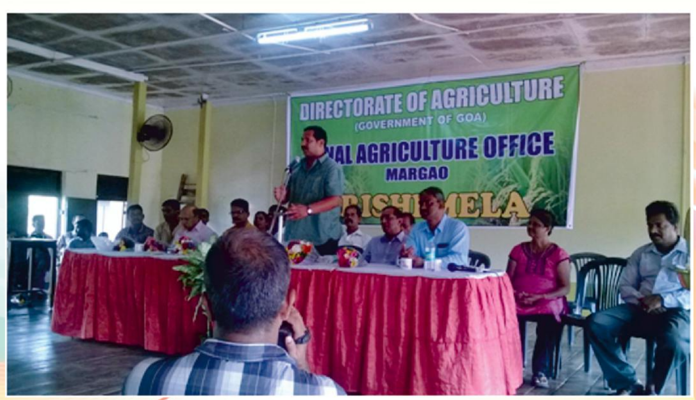
Honble Minister for Fisheries Shri Avertan Furtado at inaugural programme of Krishi Mela at Navelim