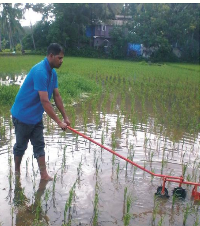
Demonstration of hoeing in paddy plot.