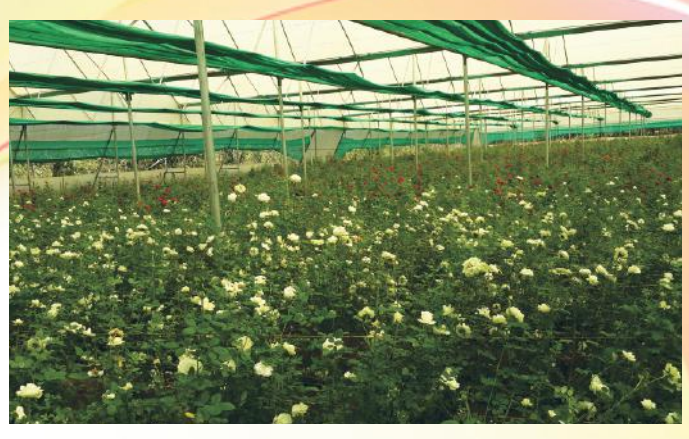
Rose Cultivation under poly house in Nertavali Sanguem