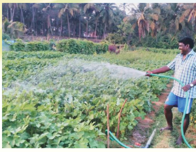
Farmer with profound growth of Bhendi crop with improved varieties