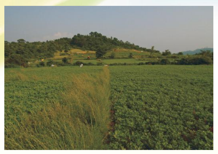
A view of Mechanized dibbled full grown Groundnut plot in Hassapur.