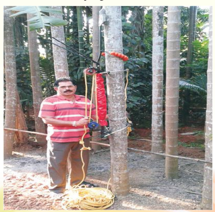
Improve arecanut harvestor Demonstration