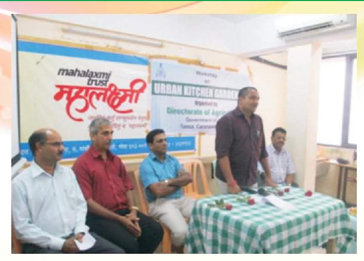
Hon MLA of Panaji Siddharth Kuncolienkar addressing during workshop organized on Urban Kitchen gardening at Panaji