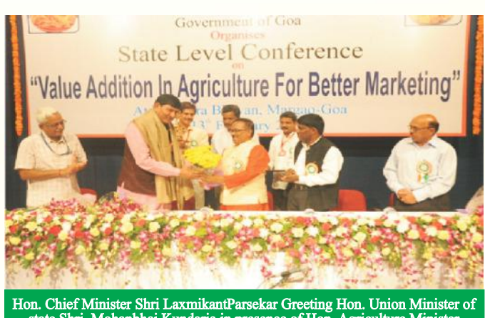
Hon. Chief Minister Shri LaxmikantParsekar Greeting Hon. Union Minister of state Shri. Mohanbhai Kundaria in presence of Hon. Agriculture Minister Shri. Ramesh Tawadkar.

1200 delegates from all the parts of state attended conference on Value addition on 13th February 2016. The value addition conference was inaugurated by Hon, Chief Minister Shri. LaxmikantParsekar in presence of Hon.Union Minister of State for Agriculture Shri.MohanbhaiKundaria and Hon. Agriculture Minister Shri Ramesh Tawadkar. Different value added products were displayed and talks were given by various faculties on value addition.