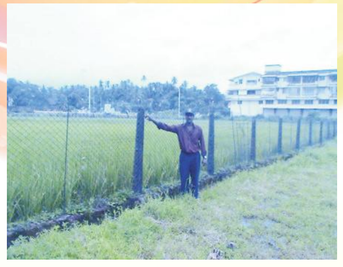
View of Chain link Fencing at Taleigao village