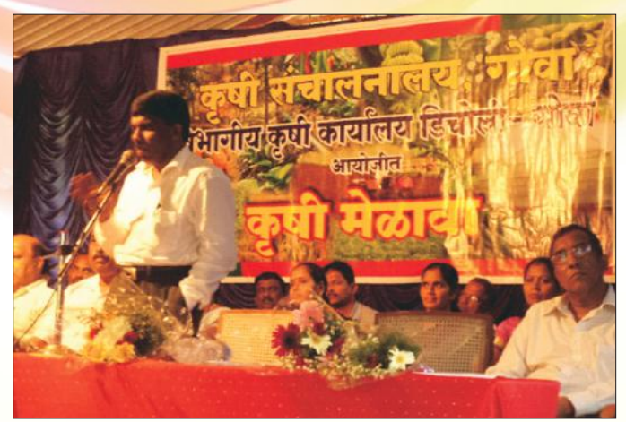
Honble Minister for Agriculture Shri. Ramesh Tawadkar addressing farmers during Krishi Mela at Bicholim