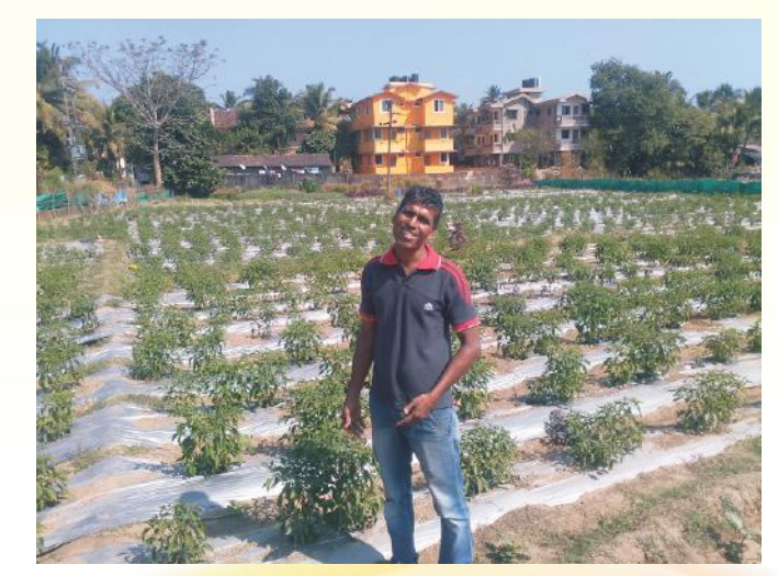
Farmers with profound growth of vegetable crop with improved varieties and technology.