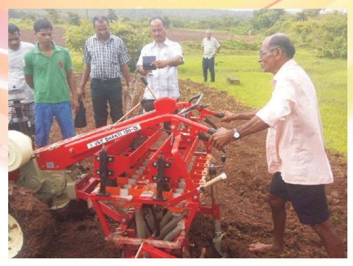
Demonstration of power tiller operated Seed drill at Hassapur