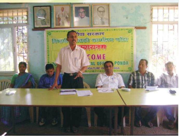
Honble Minister for PWD and Transport Shri.Sudin Dhavalikar attending a special awareness meeting for farmers.