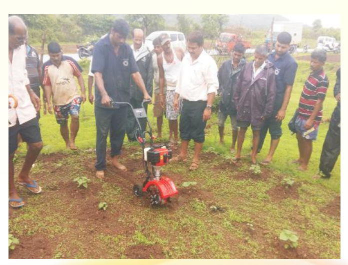
Demonstration of Power Weeder for weeding in Bhendi and other crops at Pernem