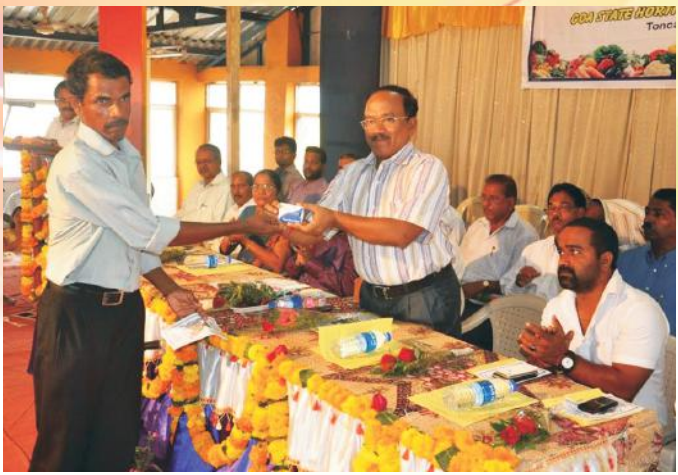
Honble Chief Minister Shri.Laxmikant Parsekar handing over Krishi card to farmer at Pedne.