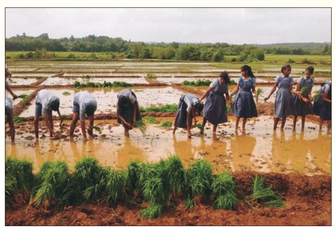
Students doing transplanting of Paddy with SRI technique.