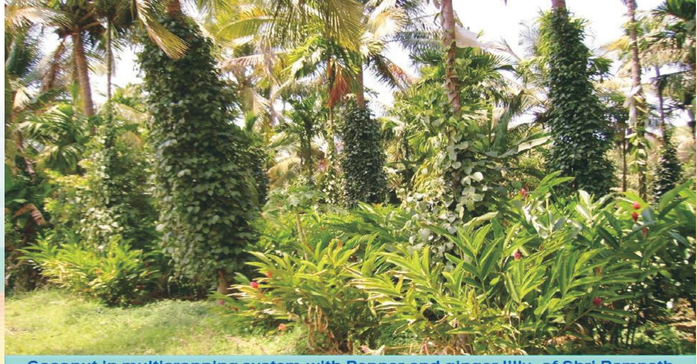
Coconut in multicropping system with Pepper and ginger lilly of Shri Ramnath Bombo Velip at Coclomba Rivona