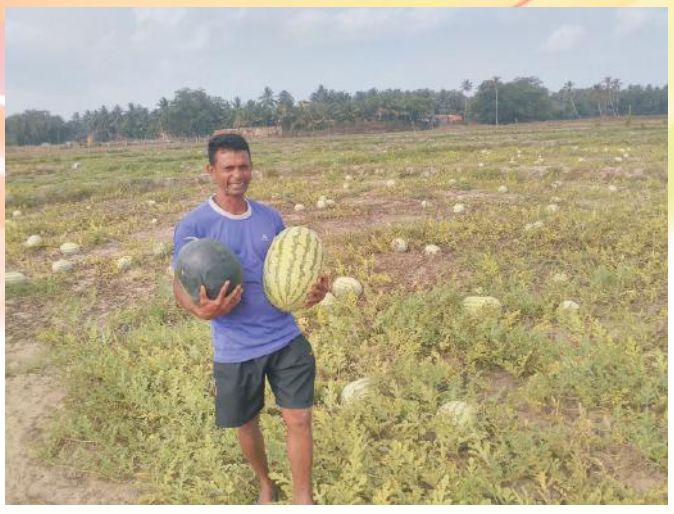
Farmer with bountiful yield of watermelon with improved varieties.