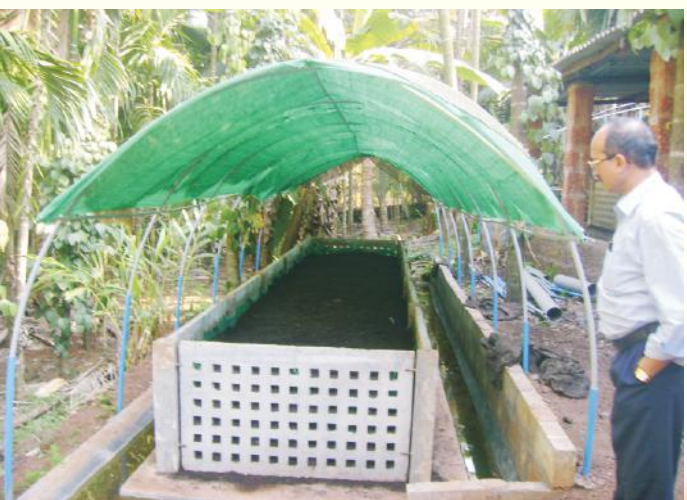
A vermicompost unit assisted by the directorate.