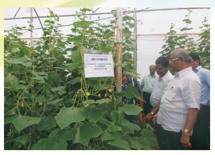
Honble Minister for Panchayat and Forest Shri.Rajendra Arlekar visiting a Polyhouse Cucumber Cultivation unit at Torse