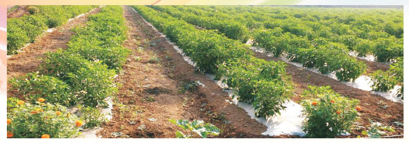
A view of Hybrid Chilli vegetable plot cultivated with Drip irrigation and Mulching technique at Korgao.