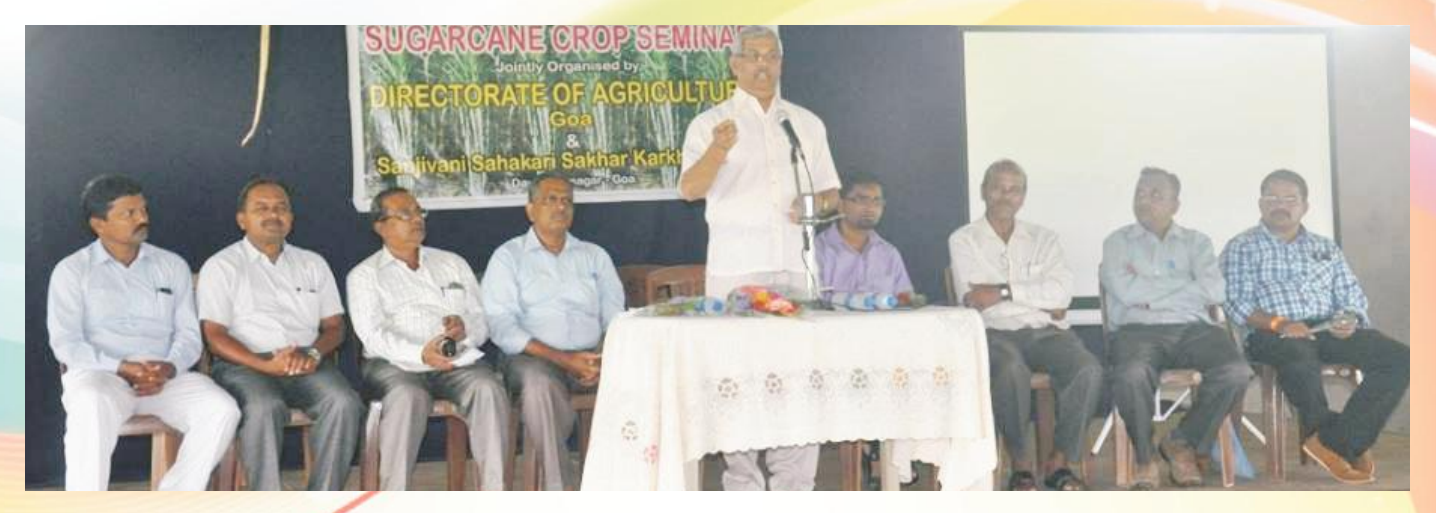
Honble Minister for Panchayat and Forest Shri.Rajendra Arlekar addressing the farmers at Sugarcane crop Seminar organized at Casarvarnem