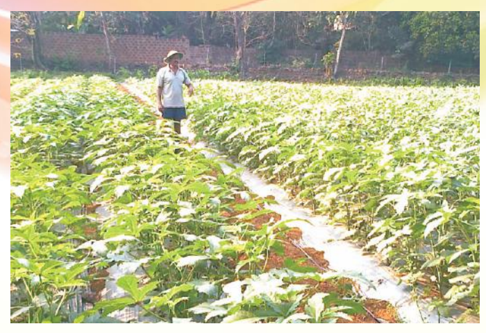
Bhendi Cultivation in Bardez