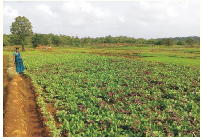
A view of Vegetable plot in Virnoda.