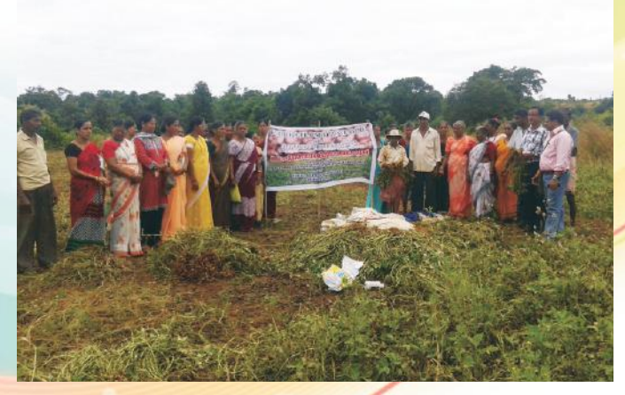
A view of Groundnut demonstration plot in Virnoda with beneficiaries under RKVY programme during harvesting