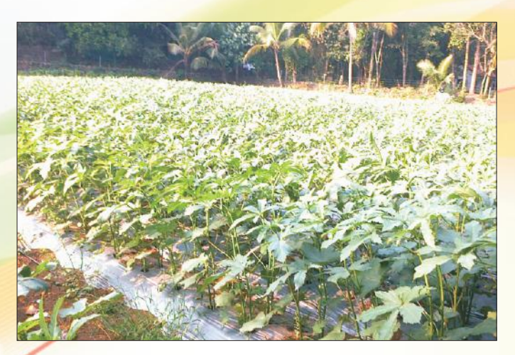
Plastic Mulching in Bhendi