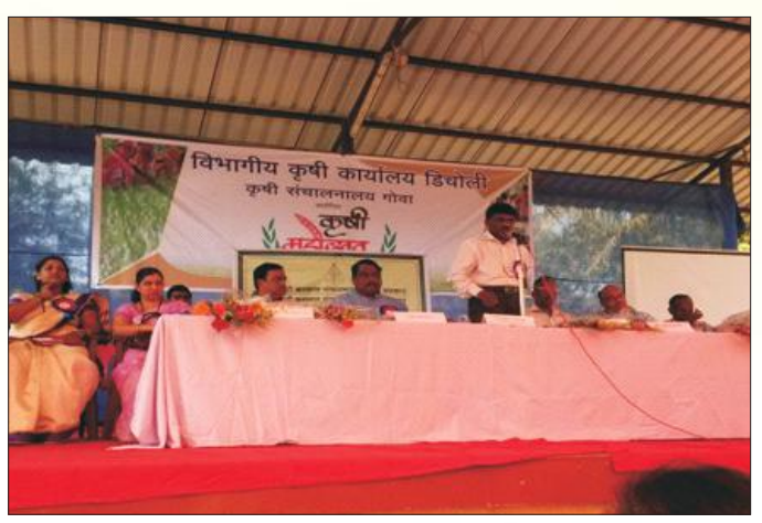
Pre Rabi Krishi Melava