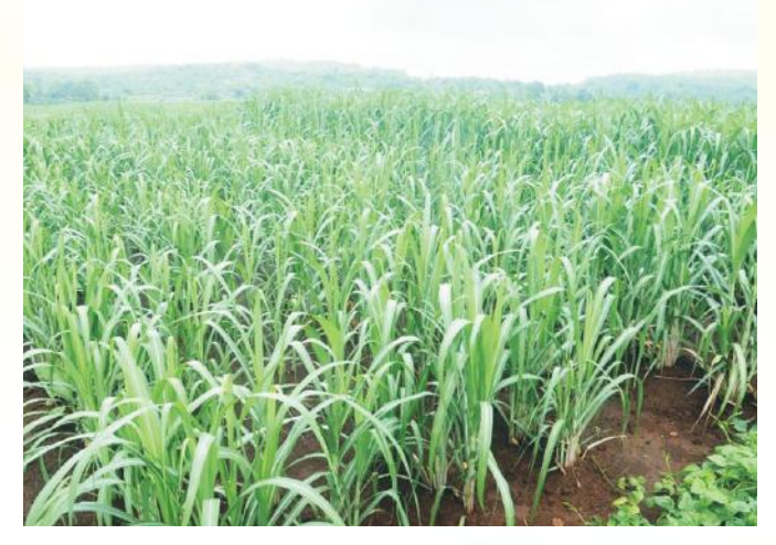
Sugarcane Cultivation in Pernem