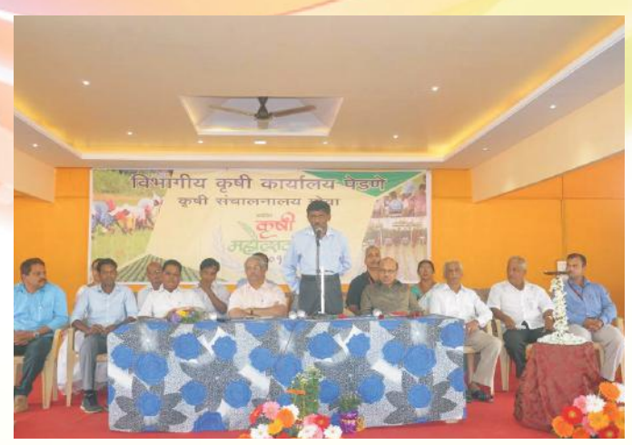
Honble Minister for Agriculture Shri.Ramesh Tawadkar addressing the farmers at Krishi mela organized at Nagzar- Pedne.