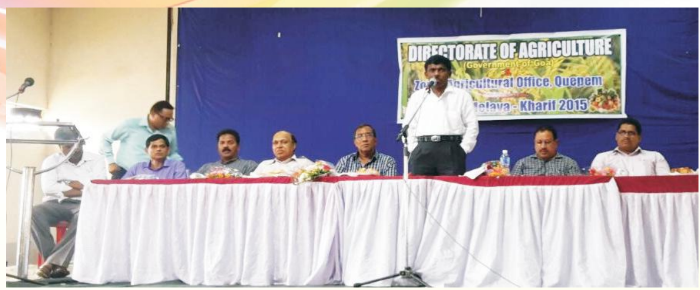
Honble Minister for Agriculture Shri. Ramesh Tawadkar addressing farmers during Krishi Mela at Curchorem