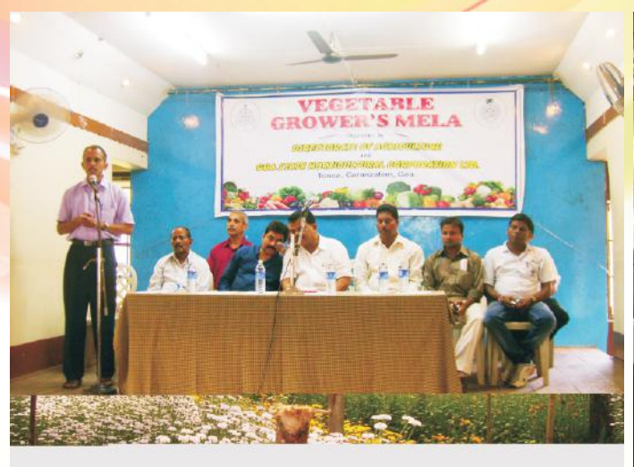
Honble Minister for Industries Shri.Mahadev Naik attending a special Vegetable Growers Mela