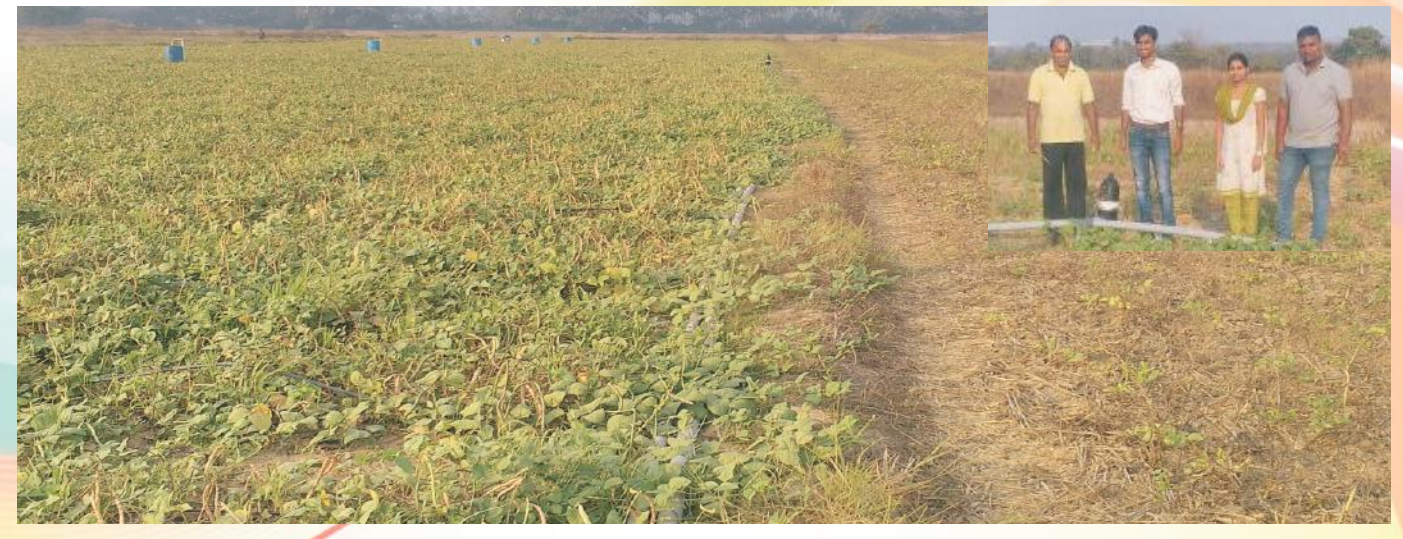
Farmers getting profound growth of pulses crop with Drip irrigation technology.