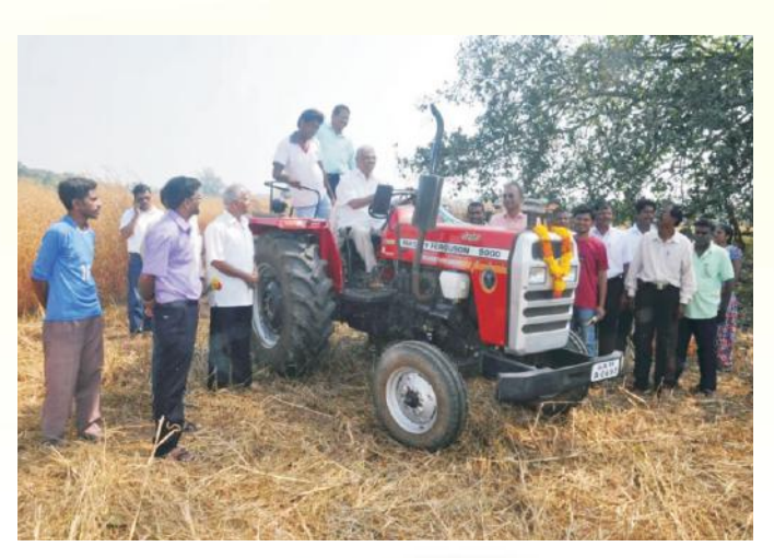
Honble Minister for Panchayat and Forest Shri.Rajendra Arlekar launching Land preparation with Tractor for Sugarcane Crop at Casarvarne.