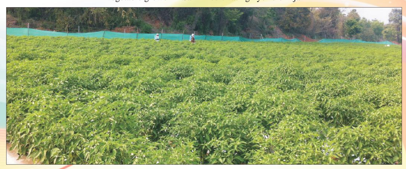
Production of vegetables has increased from 6.12 mt to 105mt during 2015-16