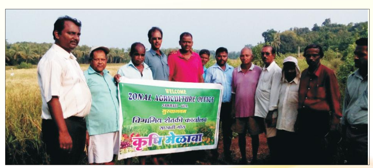
SRI field day at Ambeshi wada Amona on 29/10/2015