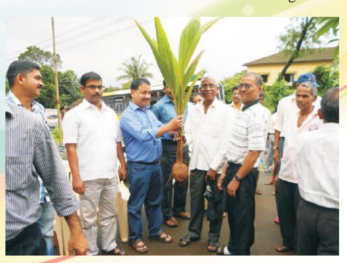
Distribution of Coconut seedling at the hands of Hon'ble MLA Shri. Subhash Phaldessai in Sanguem