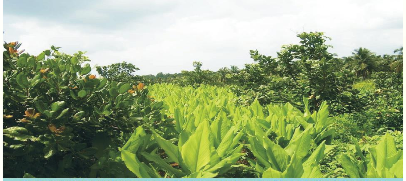
Cashew intercropping system with turmeric done by Shri. Shrihari Kurade at Vichundrem, Sanguem