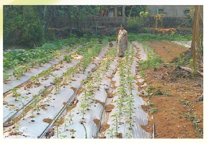
Plastic Mulching in Chilly Vegetables