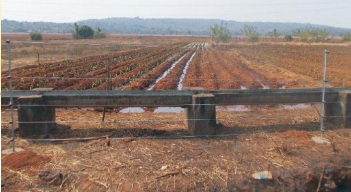
A view of Sugarcane plot protected with Solar Power Fencing in Tulaskarvadi Nagzar in command area of Tillari Irrigation Project.