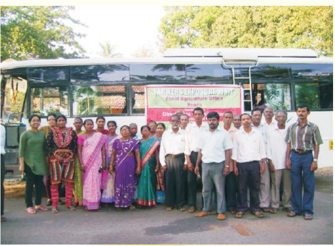
Exposure visit organized for farmers under ATMA.