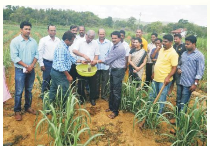
Honble Minister for Panchayat and Forest Shri.Rajendra Arlekar launching Soil Sample Campaign for Soil Health card at Ibrampur