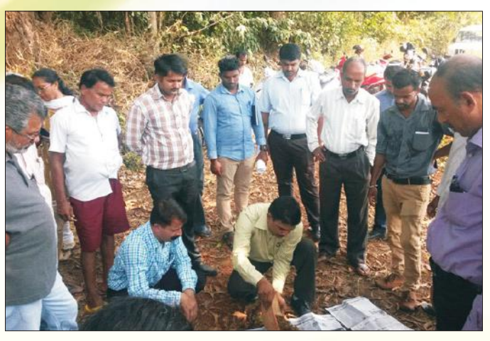
Soil sampling demonstration