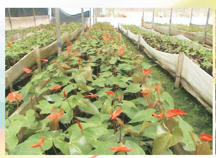
Anthurium in polyhouse assisted by the directorate.