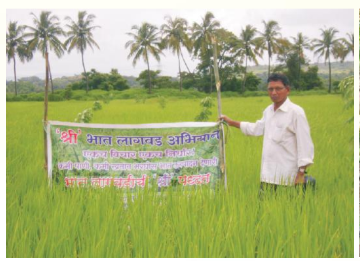
Farmer in his SRI Paddy plot