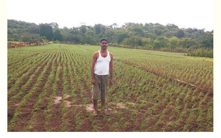
A view of Paddy transplanted with SRI method at Ozari.

Honble Minister for Panchayat and Forest Shri.Rajendra Arlekar launching planting of Sugarcane seedlings at Tulaskarwadi Nagzar