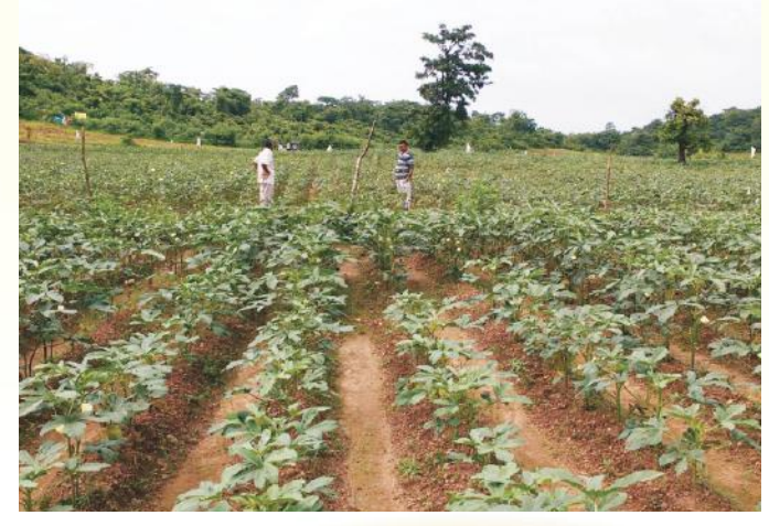
A view of Hybrid Bhendi Vegetable plot in Hassapur.