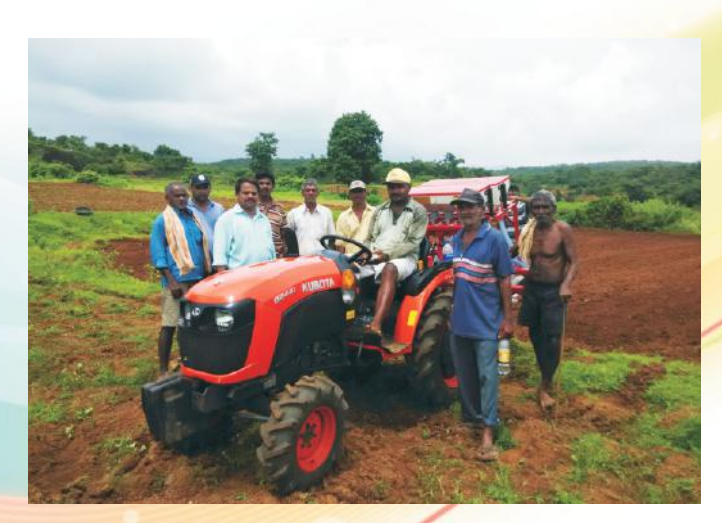
A view of mechanized cultivated plot ready for planting groundnut by Tractor mounted seed drill